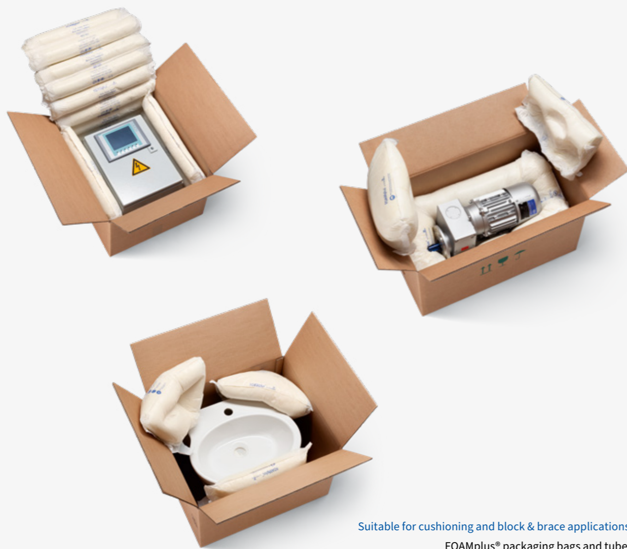
Suitable for cushioning and block & brace applications: FOAMplus® packaging bags and tubes

shape in seconds, and affords the highest degree of protection against shock, vibration and compaction. A robust solution for goods in transit and storage that ensures products arrive in perfect condition. Thanks to its low weight, it also reduces transport costs whether it's fragile ceramics, bulky bicycles or heavy furniture.