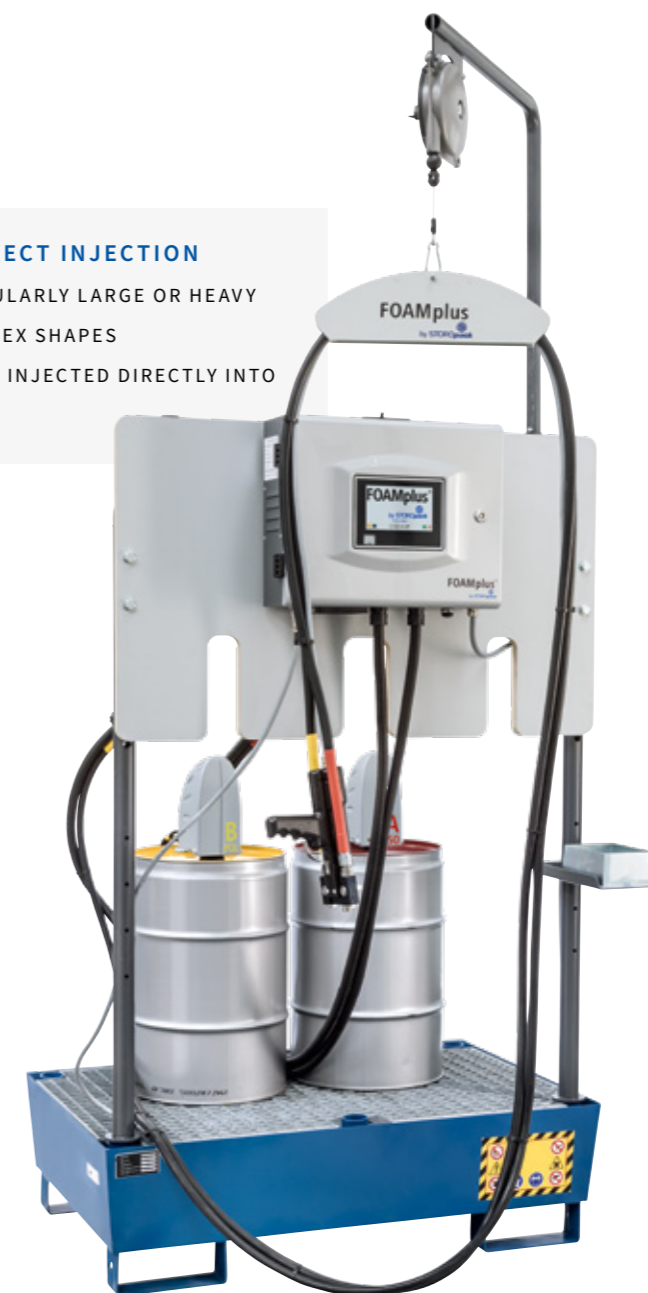
FOAMplus® Hand Packer 2 Stand Version

FOAMplus® FOR DIRECT INJECTION ▶ IDEAL FOR PARTICULARLY LARGE OR HEAVY ITEMS WITH COMPLEX SHAPES ▶ FOAM IS MANUALLY INJECTED DIRECTLY INTO THE BOX