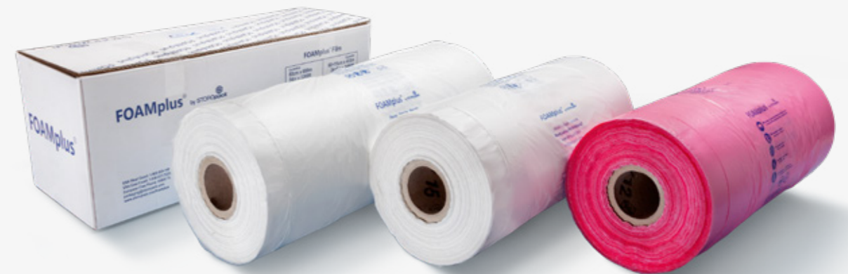
The safe and durable option: FOAMplus® films