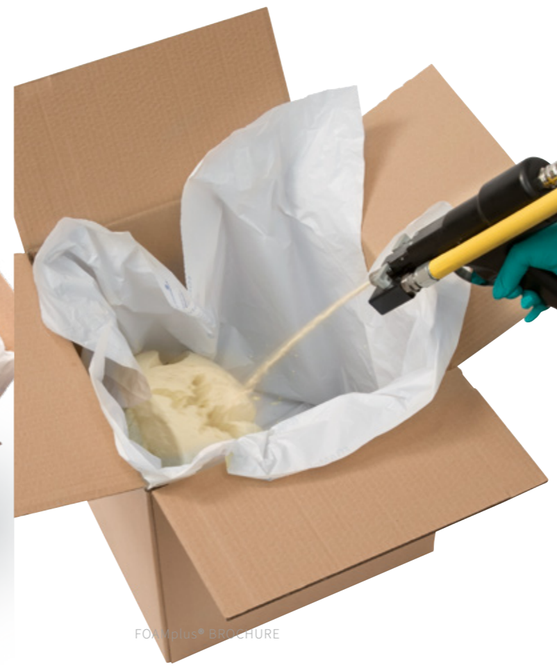
FOAMplus® Direct Injection