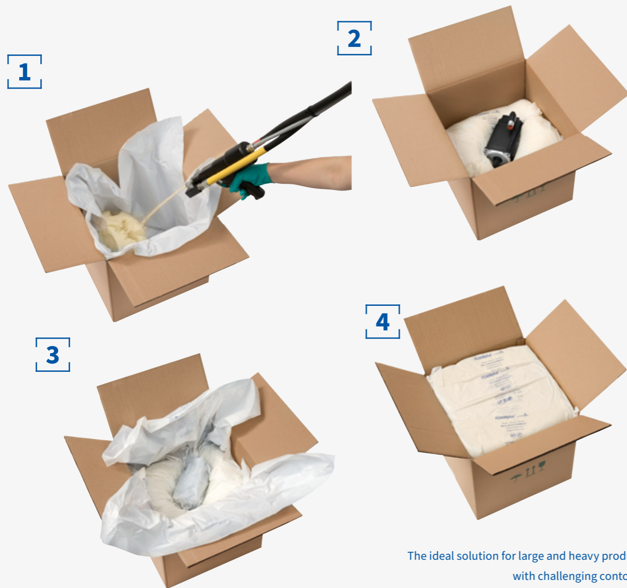
The ideal solution for large and heavy products with challenging contours: FOAMplus® Hand Packer 2 for direct injection