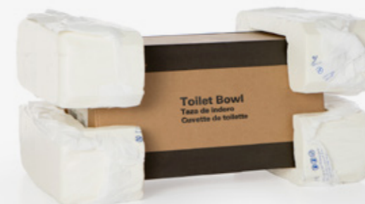
The fast solution for molded protective packaging: FOAMplus® Premold