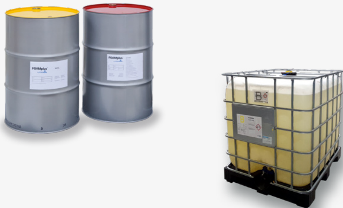
The ideal solution for any demand: FOAMplus® metal drums and containers